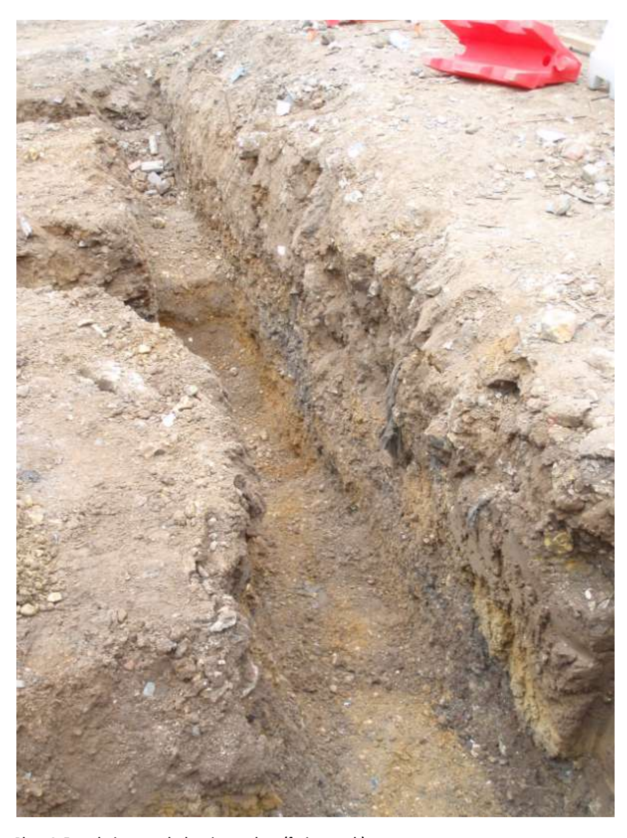
Plate 4. Foundation trench showing geology (facing north)