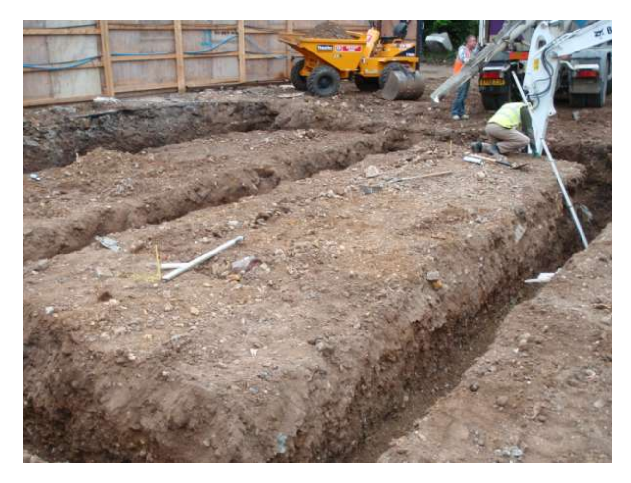
Plate 2. General view of site with foundation trenches excavated, facing north-east