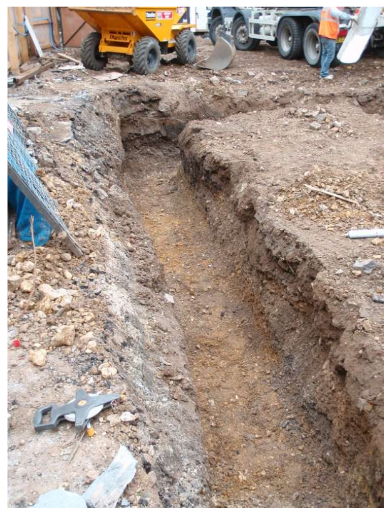
Plate 3. The site showing ground works (foundation trenches) facing east